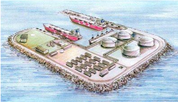
“Safe Harbor Energy,” 83-acre proposed artificial island, 13-miles S. of Long Beach, NY

These facilities represent a major privatization and industrialization of public waters. If Big Energy’s plans are approved, these waters would be covered by large “security buffers” that would deny their use to the boaters, divers, and fishermen who have enjoyed these areas for generations. More troubling still, the projects would bring heavy pollution to our coast. Marine life will be destroyed by the construction of the pipelines and terminals. The facilities would require numerous deep-water anchor chains that according to an environmental impact statement for a similar project in Massachusetts result in “long-term reduction to benthic [bottom]” habitat across an area of up to 38-acres per chain. These plans would also require the uptake of billions of gallons of sea water per year for use in gasification, ballasting, and ships waste. That water would be returned to the ocean at a different temperature and filled with a habitat-killing brew of chlorine and other biocides. One plan—the plan that is furthest along in the approval process—even calls