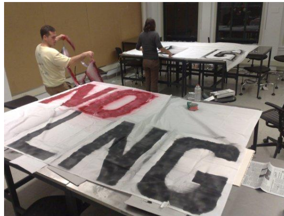
Surfrider members just spray-No!

Far from being a cheap fuel, LNG is nearly twice as expensive as domestic natural gas. In fact, existing US LNG ports are only being used at about 10% of their capacity because the US has such large supplies of cleaner, less expensive domestic gas. Both energy and government sources agree that the US's large reserves will easily outpace domestic demand and last for at least 60 years! Thus, these companies are seeking to keep us dependent