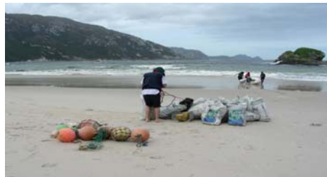
Part of the rubbish collected