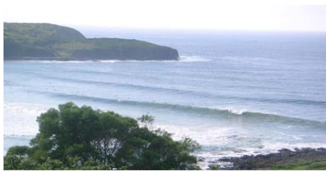
The waves at "The Farm"

There is going to be meetings in May and all of the community groups who have involved themselves in discussing this development will be there. I look forward to reporting on this development in the further.